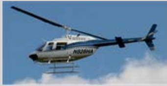
Pictured above is the helicopter, Bell 206 with the tail number 828HA.

Click HERE for more information and to apply.