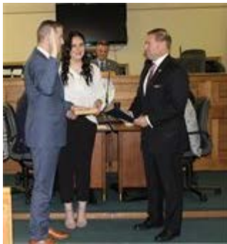
Monmouth County Sheriff Shaun Golden issued Tony Perry's Oath of Office as Mayor of Middletown for 2019.