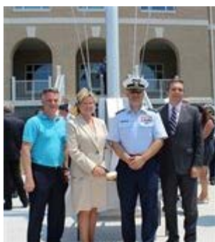
The ribbon cutting for the new facility at U.S. Coast Guard Station Sandy Hook was held in front of the Multi-Mission Building